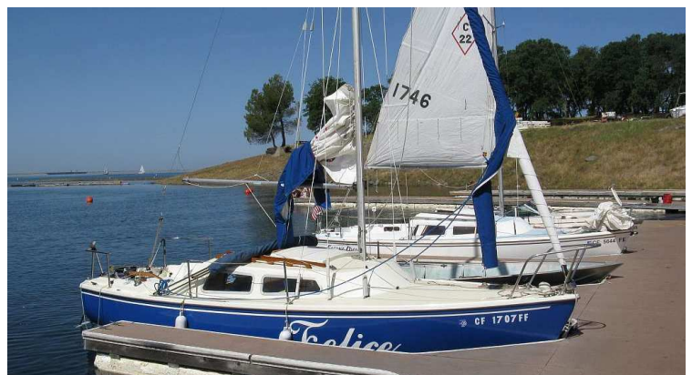
Apr. 25, 2009, 10:52. Folsom Lake, "Felice" and "Cosmic Dream" at the start of the New Member's/Past Captain's Cruise