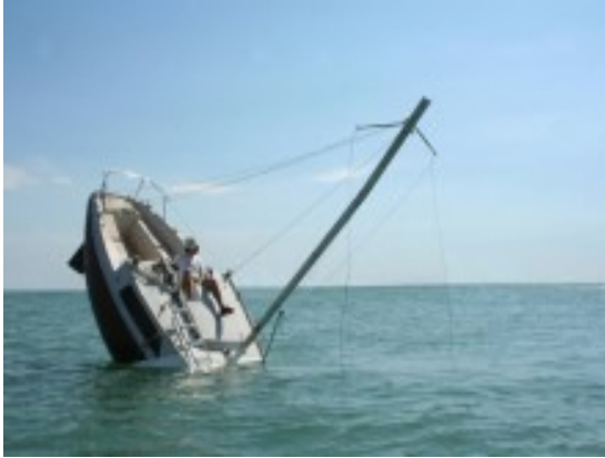
See page 8 for details of this sad event