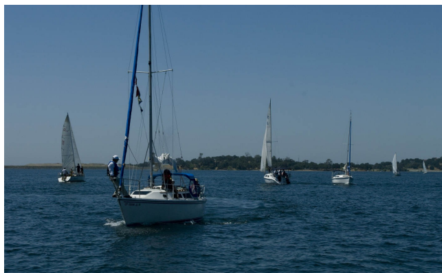
1. Illustration: The Fleet on Maneuvers

Once again, Catalina 22 Fleet 4 and Folsom Lake Yacht Club, have pulled off a superb event. On June 25 th , we hosted 46 guests from the Big/Little program. Offering pleasant gentle breezes all morning, and reasonably comfortable temperatures, there was time for sailing, playing, and eating. Getting out onto the water between 9:30 – 10:00 AM, the skippers easily entertained with speedy excursions around the main body of the