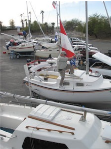
Rigging at the launch ramp.

Surpassing all these events is the Lake Havasu Pocket Cruiser Convention. Held at the convention center of the London Bridge Resort, there were displays and representatives from several sponsors -- J.O. Woodworks, Kelly-Hanson Sails, Interlux/Awlgrip Paints, Hyde Sails, and WaveFront Marine -- doing brisk business. The seminars covered Cruising Chutes, Boat Painting (they actually painted a dinghy on stage!), Man Overboard Procedures, Sailing Southern California, Outboard Motor Maintenance, Raymarine Electronics, Sailing Medicine for Dummies, The 4 Elements of Sail Trim, Sailing the Singlehanded Trans Pac in a Pocket Cruiser (from both the sailor's and his wife's perspectives), Sailing Santa Cruz Island, the New Sage 17 Pocket Cruiser, and even a couple craft project seminars for those who were tired of all the boat stuff. All were excellent. The dilemma was in deciding which seminars to attend or skip in order to have extra time sailing!