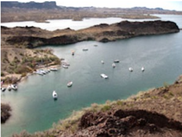
Steamboat Cove. An impromptu BBQ gathering before the event.

daily from boisterous to drifters, allowing us to enjoy all types of sailing from reefed down to spinnakers. The Parade of Sail under the London Bridge was spectacular with dozens of sailboats coming down the channel in a long line. Several sailors were unable to bring their own boats, but there was no problem finding someone to sail with. Skippers were more than happy to show off their boats, most of which had been customized personally to suit their needs. My 1976 Montgomery 17, CornDog, stayed home buried in the snow, but I raced and daysailed on several boats, including some very rare models, like Sean's 1979 Montgomery 23 ( havasumontgomerys.piczo.com ), Bill Barnhart's 1962 Champion 21 ( billsboat.webs.com ), and the Sage 17 prototype ( www.sagemarine.us ).