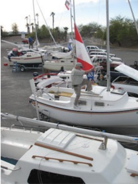
Rigging at the launch ramp.

Whether digging their boats out of snow banks and heading south in the winter or hauling them out of desert lakes and trailering north for cooler weather in the summer, they join every event they can find.