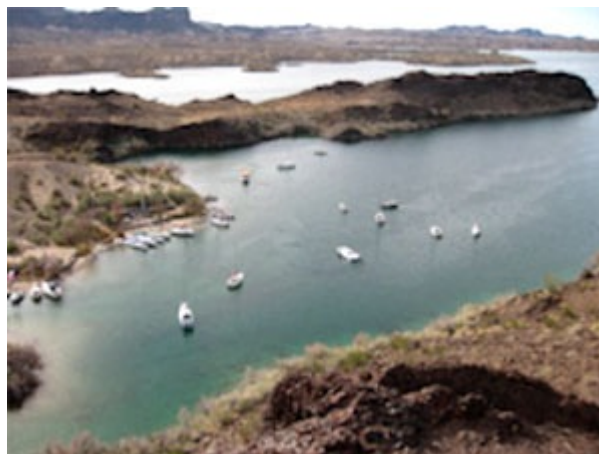
Steamboat Cove. An impromptu BBQ gathering before the event.