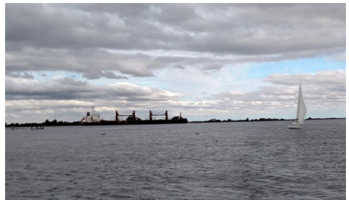
A freighter comin' round the bend.