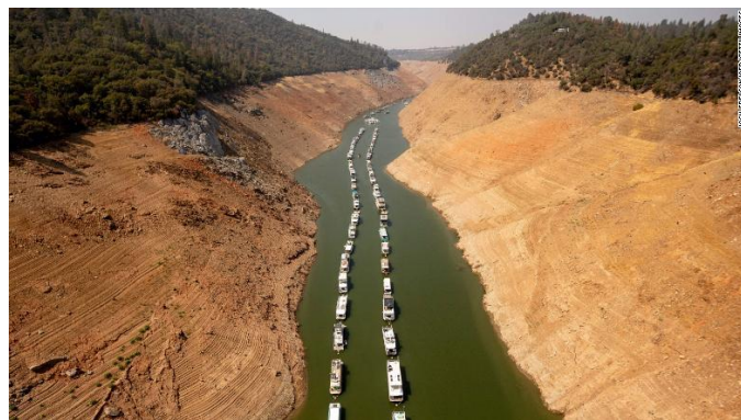
Houseboats in depleted Lake Oroville (9/5/21 CNN)