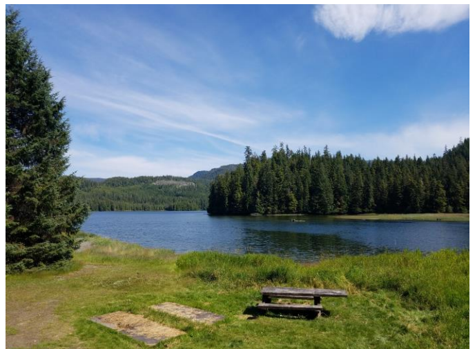
Polk Inlet, Alaska.