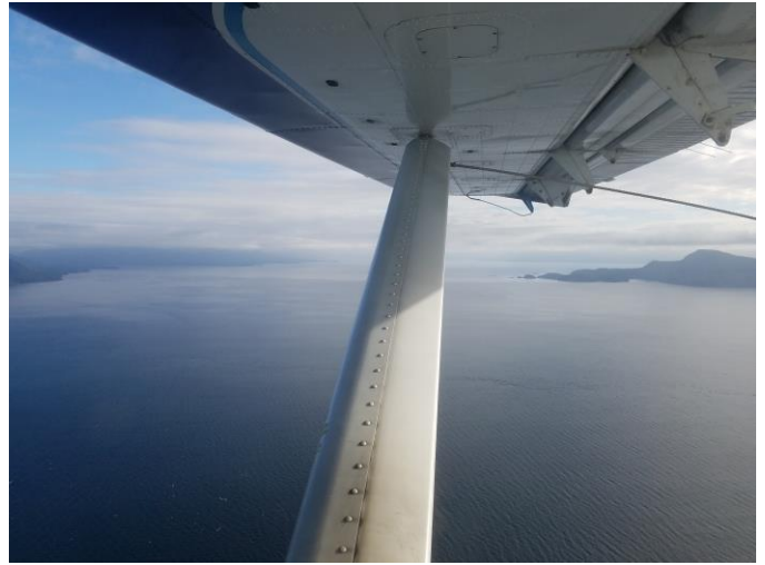
View of Prince of Wales Island from the float plane.

The next day we took a small float plane to Prince of Wales Island, Thorne Bay. This is a very small town that was our home-base for the trip. With only a liquor store and a convenience-grocery in town, we had everything we needed for a guy's trip!