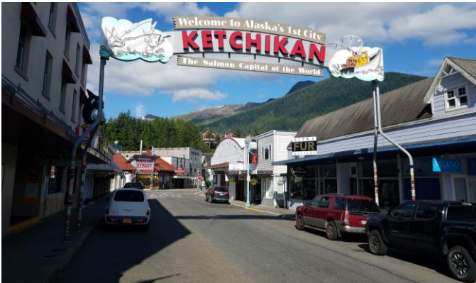
Downtown Ketchikan, Alaska.

My latest travel adventure was a trip to Alaska last week. A friend invited me to go fishing with him. It has been almost ten years since my last Alaskan fishing trip, so I thought I was definitely due. The trip started in Ketchikan, Alaska. This is an interesting town with a lot of little shops, heavily geared towards tourists. The town's character changes radically with the arrival and departure of cruise ships.