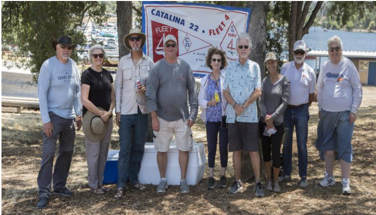
Fleet 4 participants in this year's Bigs & Littles Sail Day.