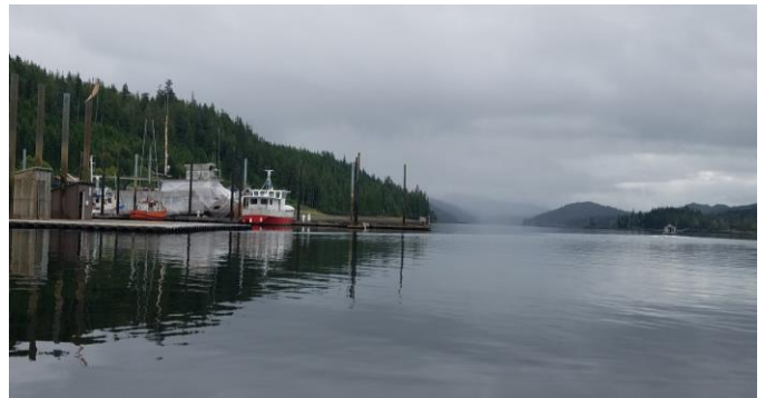
Thorne Bay, Alaska.

Our quest for fish led us to fishing in Thorne Bay, Polk Inlet, Coffman Cove, and Whale Pass. We covered a lot of the island and saw lots of wildlife; deer, eagles, bears, and whales. It was amazing! We also were blessed by unusually nice weather. In fact, we only had one day that had a little rain, and that was over in a couple of hours.